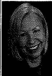
Associate Broker Parishioner