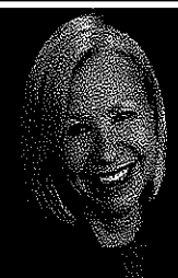
Associate Broker Parishioner