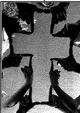
students created this picture which they titled "Cross Your Fingers."

"Catholic education, and the students who are the products of it, have been called the 'greatest work of the Church'." 2 We are grateful to members of our parish who with their prayers and support are allowing Our Lady of the Valley, through the ministry of its Catholic school, to continue the work of faith building for this and future generations. Thank you and God bless you!